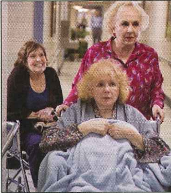
"Another Harvest Moon" kicks off the Hollywood Film Fest on Oct. 23.